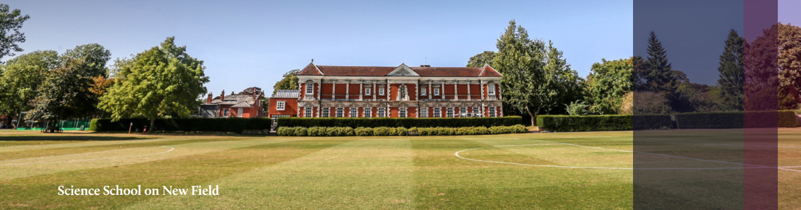
Science School on New Field

Financial support is available for pupils applying for entry at 13+ or at 16+ (day or boarding). Processes and timescales differ depending on your stage of entry and whether you are applying through the scholarship route at 13+.