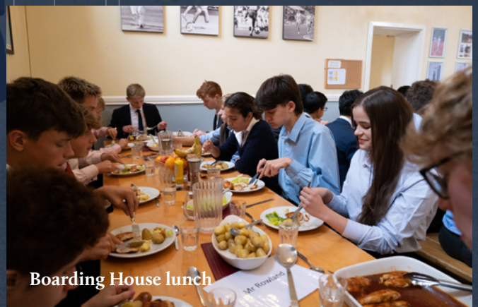
Boarding House lunch

Bursaries range from 5-100% of the full fee covering tuition, food and board. It can include support for additional items – including school trips, a laptop and music lessons. At Winchester we annually means-test all bursary awards, and take into consideration a wide range of financial and other circumstances in assessing support. Each application is closely reviewed by a member of the Bursary team, and for families who are curious about the process we are more than happy to provide an indicative assessment to answer whether they might qualify for support if they were to apply.